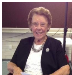
History Heritage morning tea